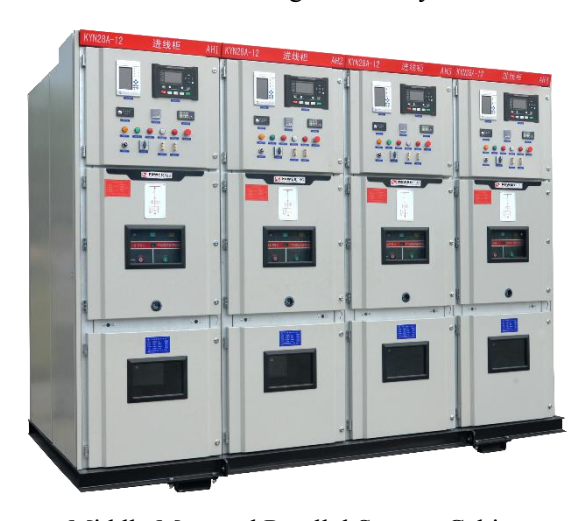
Middle Mounted Parallel System Cabinet