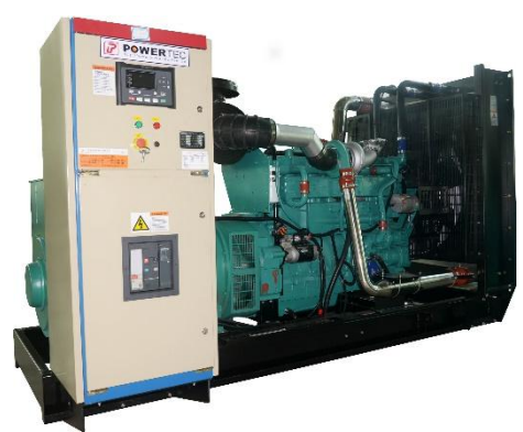
Genset Mounted Parallel System