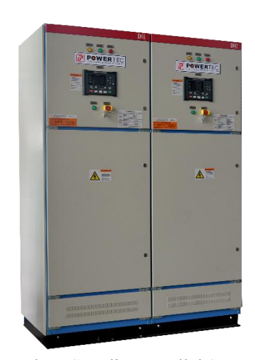
Floor Standing Parallel System